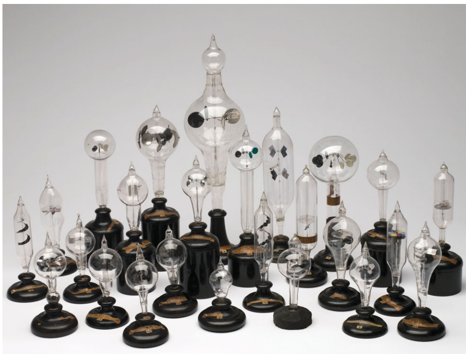
Figure 1. The Royal Society's collection of Crookes's radiometers and otheoscopes. (Online version in colour.)

series of abstracts in Proceedings of the Royal Society , 8 and produced in full slightly later in Philosophical Transactions . 9 His work on cathode rays followed directly. 10