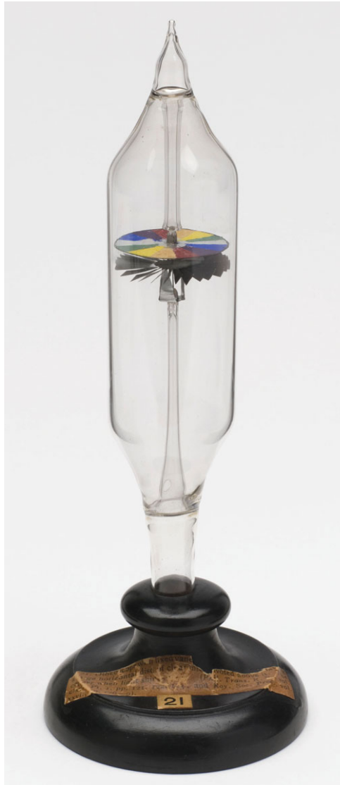
Figure 6. Otheoscope operating a Newton's disc. (Science Museum inventory number 1920-403.) (Online version in colour.)

In the otheoscope then described, the driving surface is a disc blackened on the upper surface, with a fly above consisting of vanes at 45^\circ to obtain the maximum rotational effect. 47 To avoid any perceived loss through tangential action, Crookes devised an instrument that had the driving disc, blackened on the upper surface, bent into the form of vanes positioned to face the fly vanes. 48 Another (figure 6) ran a Newton's disk: 'When exposed to sunshine the speed was so great as to cause the colours to blend together in a neutral grey.' 49