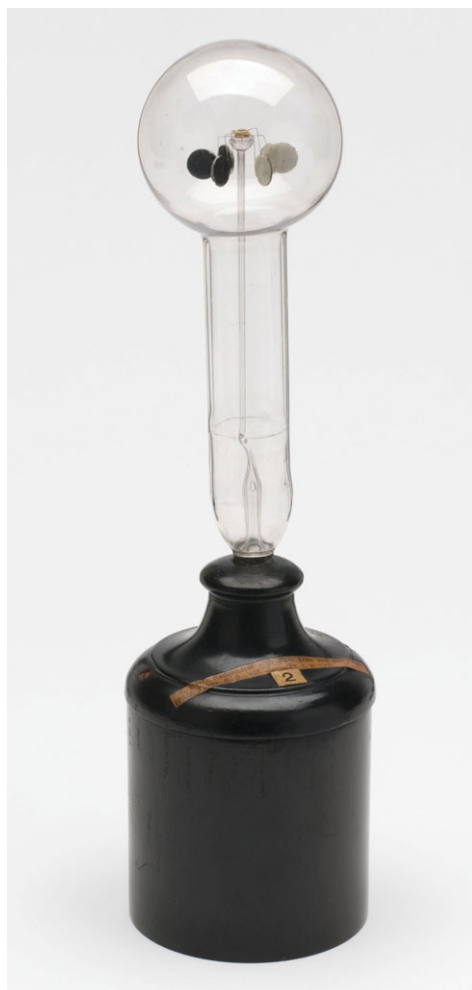
Figure 4. Early radiometer with six vanes. 64 (Science Museum inventory number 1920-412.) (Online version in colour.)

After experimenting with polarized light, Crookes again returned to the radiometer. An accidental anomaly with a crumpled vane set him investigating the variations attributable to inclination. 31 A lengthy series of trials varying the position of the radiant source, and considerations concerning lines of molecular force, led Crookes to vary the shape of the vanes, not merely their inclination. At first he used cones, but ‘cones being inconvenient in shape’ he substituted hemi-cylinders. Aluminium was one material chosen because it was a good conductor of heat. 32