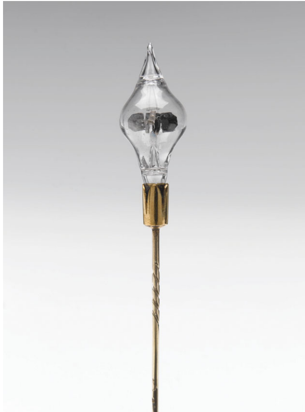
Figure 3. Miniature radiometer on a pin. 63 (Science Museum inventory number 1920-392.) (Online version in colour.)

that agent acting constantly according to certain laws which Newton held to be the cause of gravity.’ 21